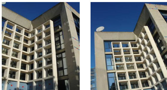
Figure 1: A difficult case of matching. Matching to nearest neighbour fails because of repetitive patterns.

be obtained and used in this robust and fast algorithm. The remainder of the paper is organized as follows. In Section 2, we describe the relaxation labeling techniques and show their limits. Then our efficient implementation is given in Section 3. Experimental results showing the improvements of the method over other existing techniques are presented in Section 4. Finally, concluding remarks are given in Section 5.