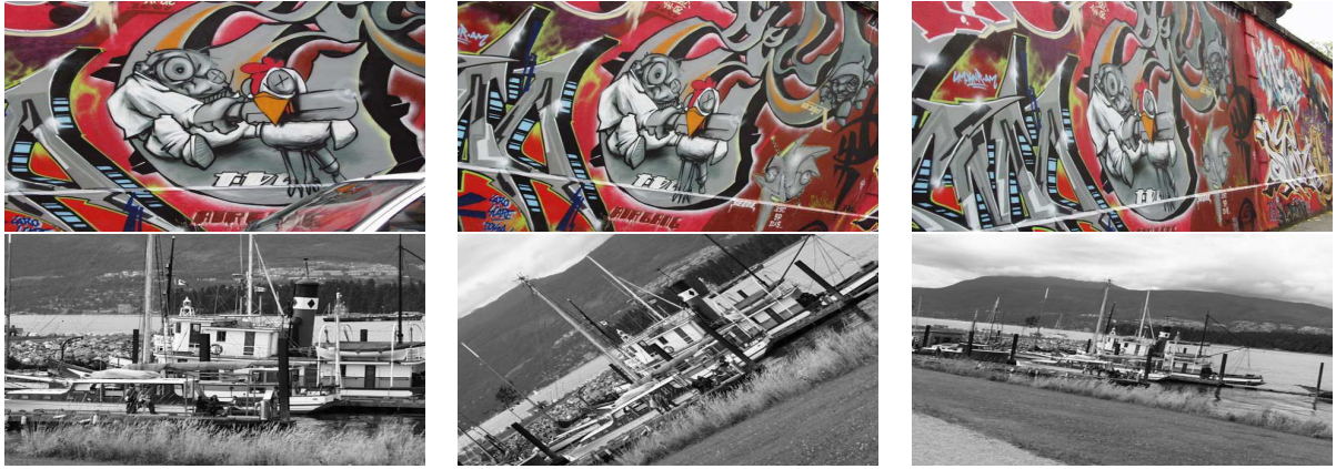
Figure 2: Examples of images used for wide baseline matching. Top: first, third and fifth frame of the Graf sequence. Bottom: first, third and fifth frame of the Boat sequence.