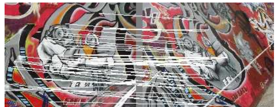
Figure 3: Example of matching results with the Graf sequence: 71 correct matches are found between the first and fourth frames.

We present an example of matching results obtained by our method for the Graf sequence in Figure 3. There are respectively 1401 and 1279 interest points detected in the first and fourth frames. The algorithm finds 82 matches between these two frames and 71 of them are correct.