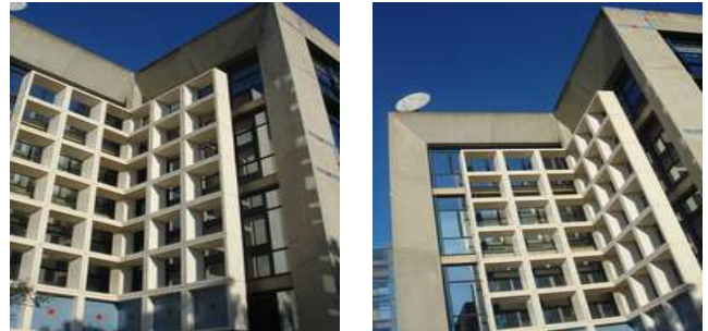
Figure 1: Matching these two images with local features is difficult because of repetitive patterns.

Despite the very good results obtained in different applications, local invariant features are not sufficient to resolve