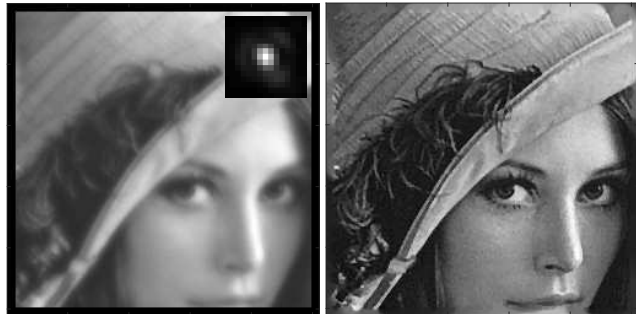
Fig. 3: On left, the observed image (241x241, BSNR=37.25dB); on top right corner, the blur kernel (15x15); on right, the estimated image (255x255, ISNR=6.12dB) after 1000 FFT evaluations by the proposed method. \lambda is tuned by hand to have possible best image quality.

Table 1 reports the relative distance between the cost function after 1500 FFTs evaluations and the optimal value (estimated by the value reached after 10000 FFTs by the best performing algorithm). When the sub-minimizations are performed using an iterative method (VMLM-B), the number of