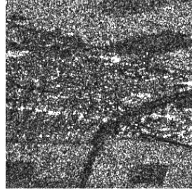
(a) Sentinel-1 (SLC)