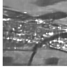
(d) restoration with speckle2void.