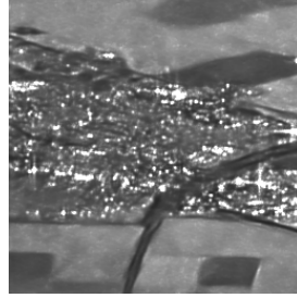
(c) restoration with SAR2SAR