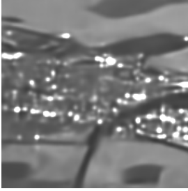
(b) restoration with SARCNN